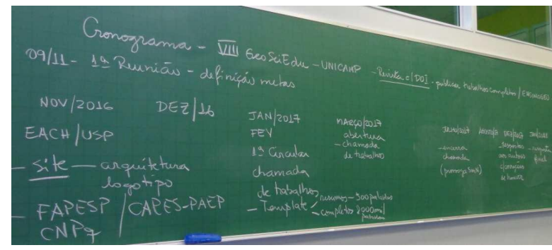
Sketch from a meeting of the organizing committee.

support the Graduate Program on Teaching and History of Earth Sciences (THES) of the Geosciences Institute of Unicamp (IG-Unicamp, Brazil) and the staff of the International Geoscience Education Organization (IGEO).